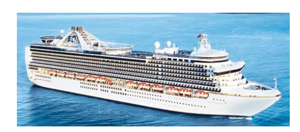
Ruby Princess Tonnage: 113,561

Guest Capacity: 3,084 (double occupancy)